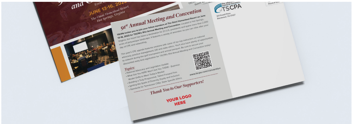
Example of print event promotions.