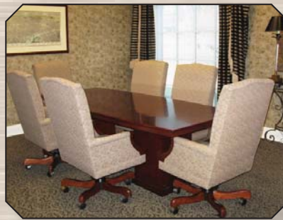
John Glenn Room

For more information please visit www.MeetAtTSCPA.com or contact us at 615/377-3825