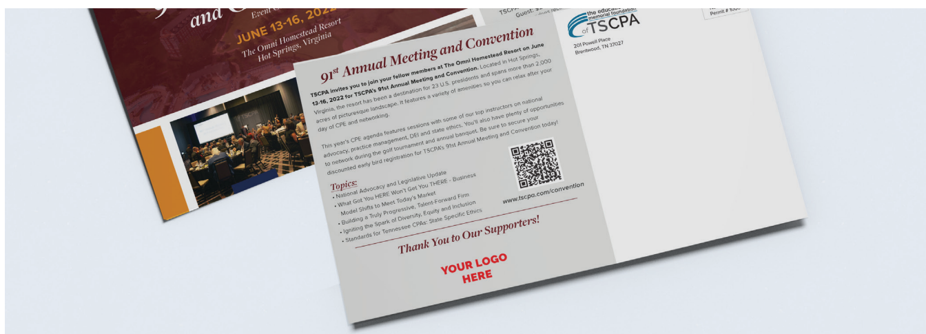
Example of print event promotions.